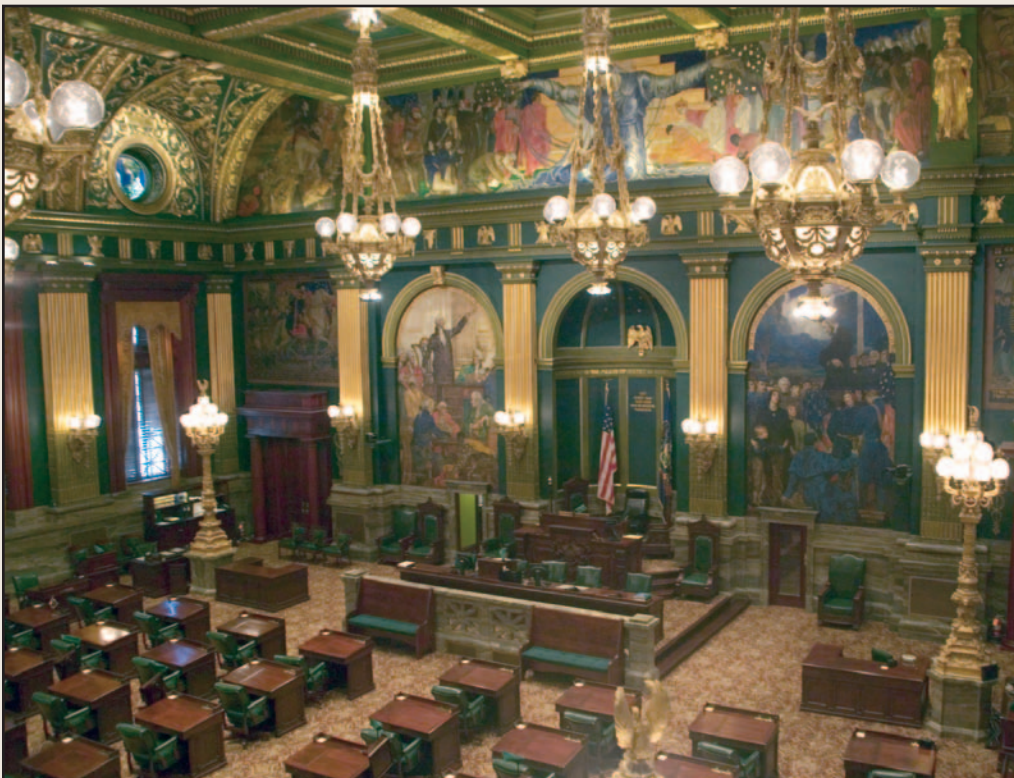
THE SENATE CHAMBER

THE RICHLY-APPOINTED SENATE CHAMBER is where Pennsylvania's 50 state senators meet to debate and vote upon legislation and resolutions. Groundbreaking female artist Violet Oakley spent more than eight years completing the murals. The desks are constructed of mahogany and imported from Belize. The drapes weigh 87 pounds per pair and the bronze light fixtures weigh 2 tons each.